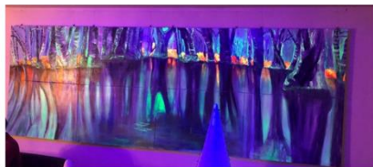
„Start to beginning again“ heißt das Gemälde – hier ein Ausschnitt –, das die Jury überzeugte.